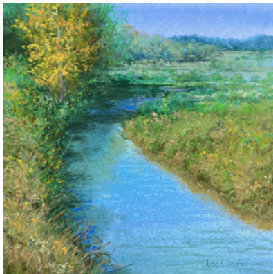
Calm On Catfish Creek

My plein air class in Grand Marais, MN will be July 6-10, 2026. Come up and join us in one of the world's most beautiful spots, learn a lot, have fun and make some friends as well! Contact me to register, more info too at lisastauffer.com